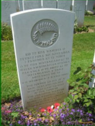
Caterpillar Valley | Longueval