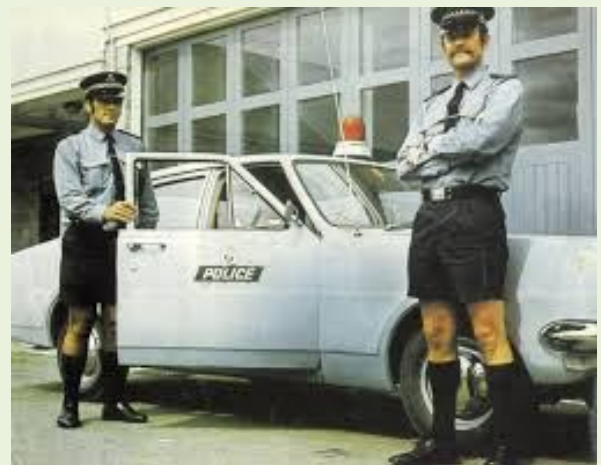
NZ Summer of 1973 was hot, hot, hot