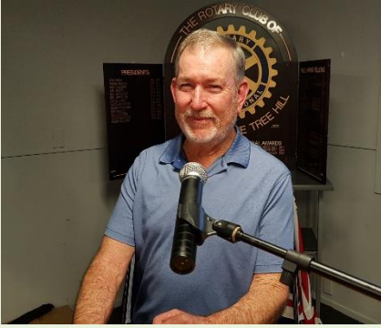
Frank Parker Mead New Zealand Warbirds