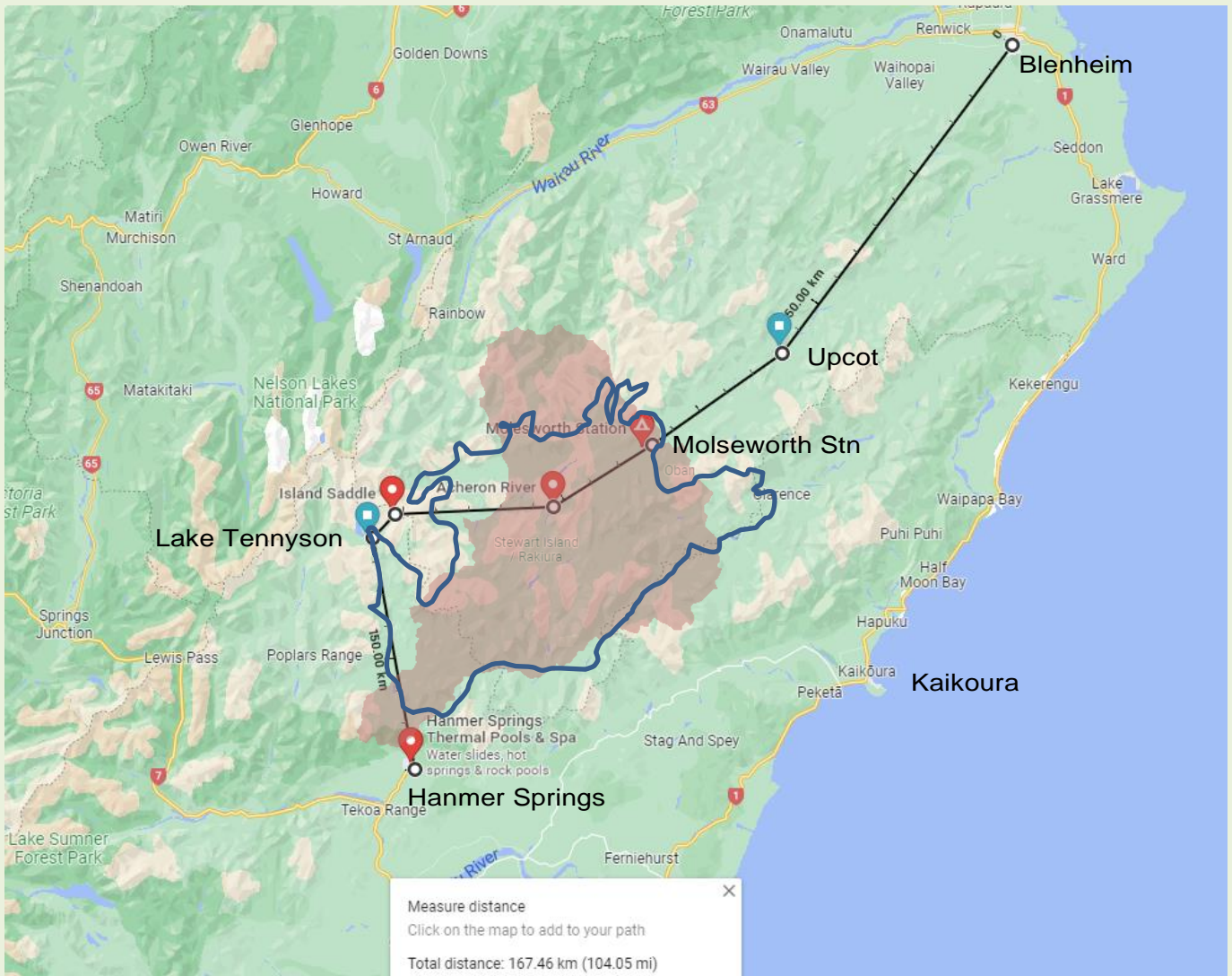
Map showing trek from Blenheim down through Upcot, Molesworth Station, Island Saddle, Lake Tennyson and Hanmer Springs. Note the size of 'Stewart Island' in comparison to the outline of the Station limits.