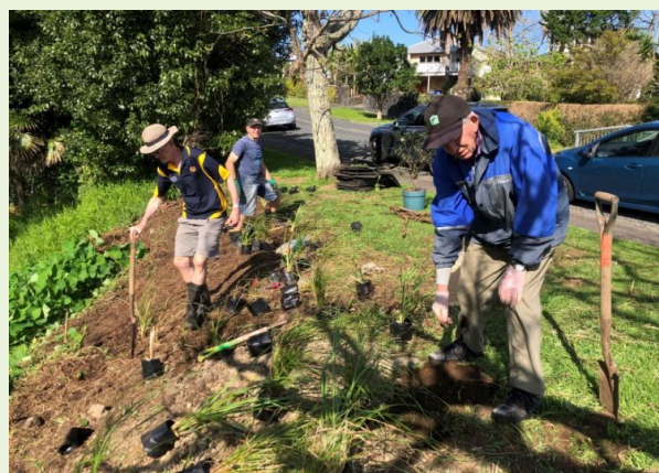
After...planting Toe toe