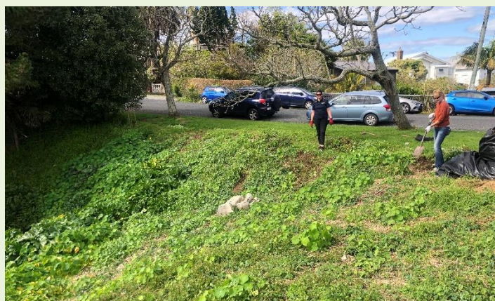
Before...clearing climbers & weeds

The working bee was to weed, plant (and get an early tan...)