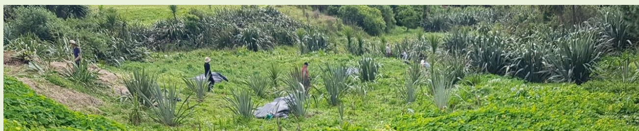
Looking north: weeding around the flaxlings