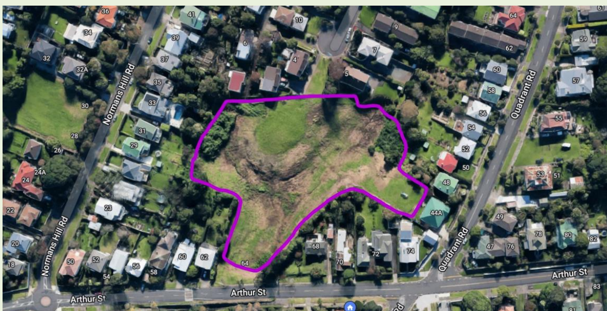
Onehunga Peoples Garden

Their first job was to remove tons of rubbish along which included old TVs and washing machines. Paul & Echo went about engaging with neighbourhood kids and parents. Local Boards provided funding for trees and shrubs which were planted by the neighbouring community.