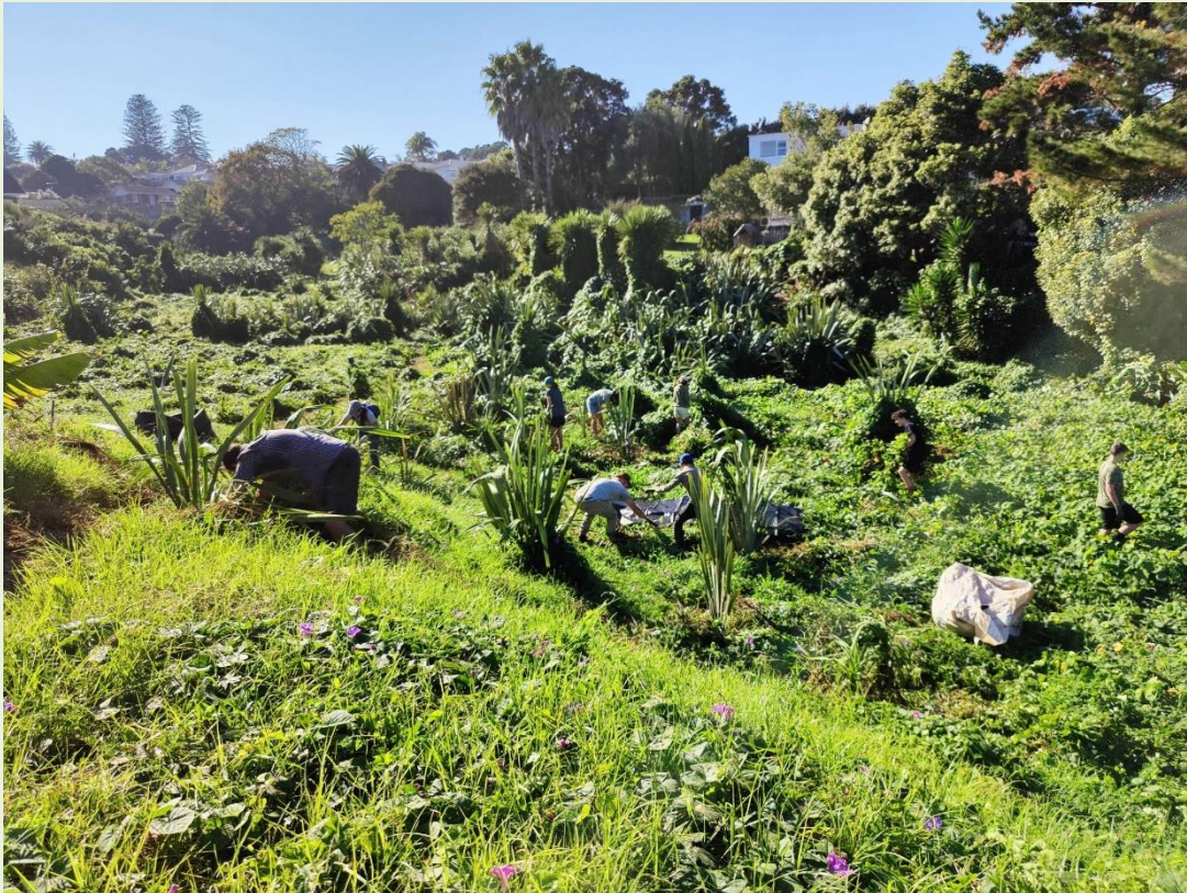
Typical Working Bee Day

include providing an opportunity to educate children on the local biodiversity and to identify and learn about the benefits of native plants and the need to eradicate noxious weeds.