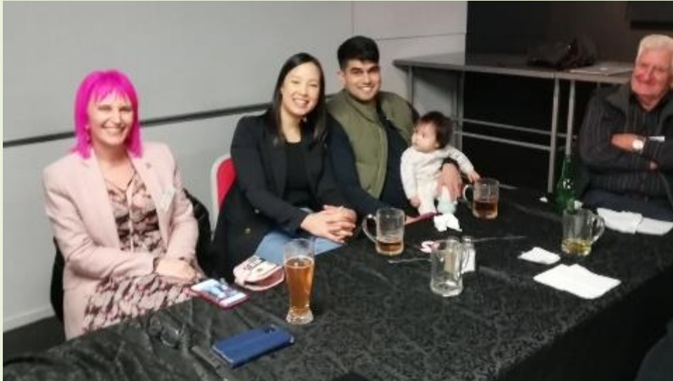
Cat's guests for the night