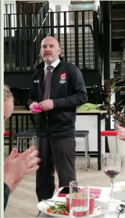
The Club was privileged to attend a Dinner Evening presented by the Year 12 Food and Hospitality students in the Onehunga High School New Building.