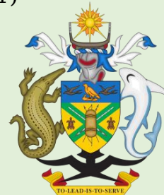
Solomon Islands Government