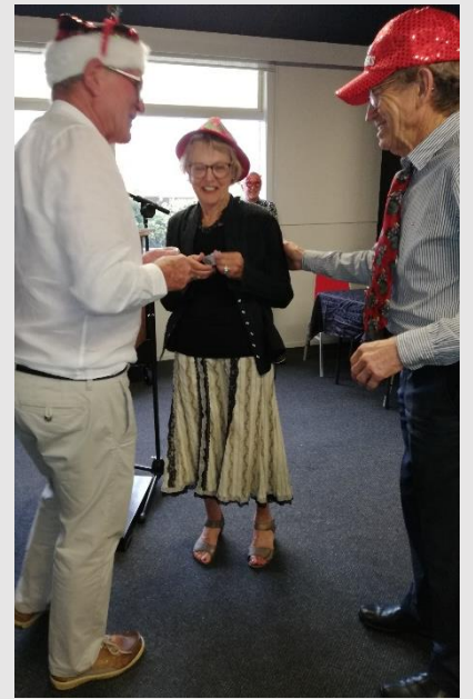
A salute to our caterers