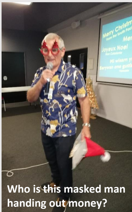
70's Club Christmas draw