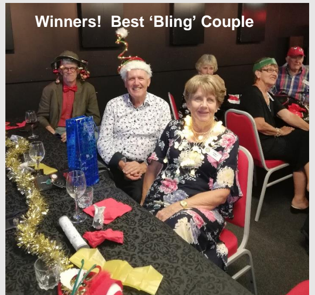
Winners! Best 'Bling' Couple

Who is this masked man handing out money?