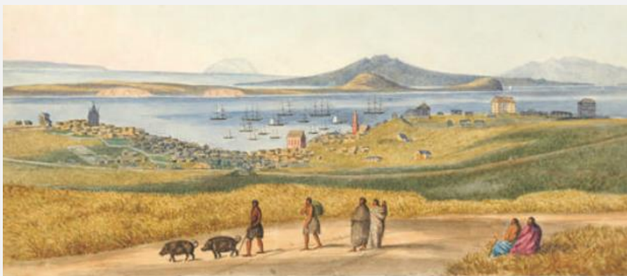
Early View from Maungakiekie