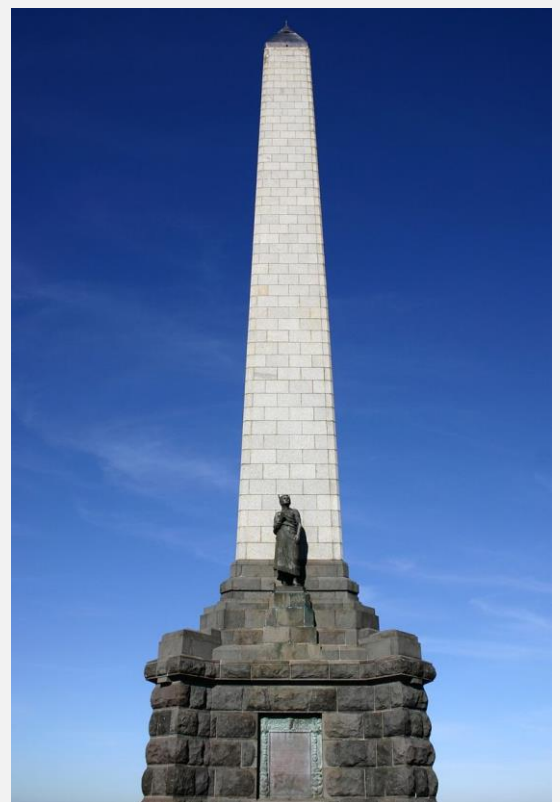
Memorial to Māori