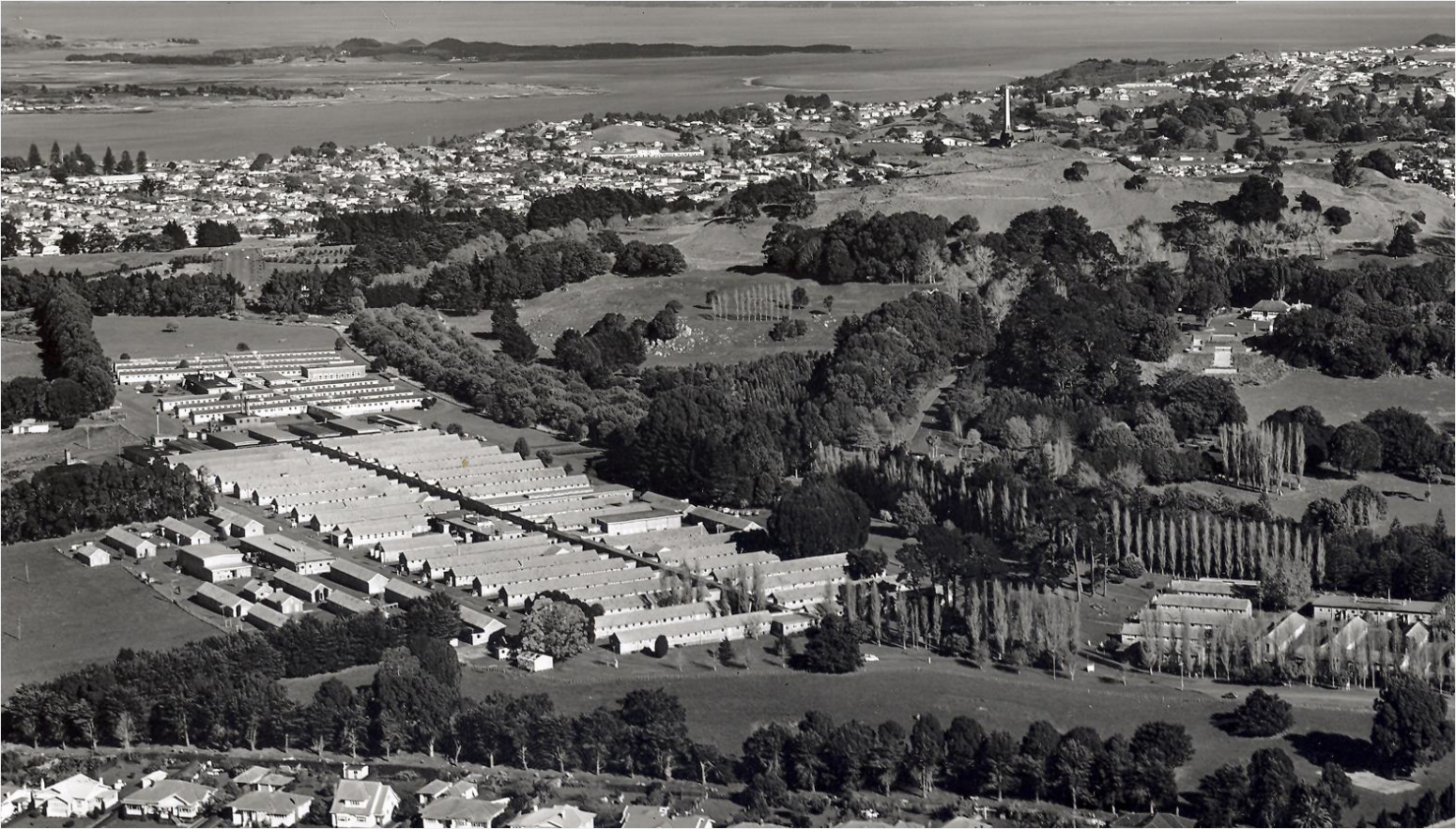
Cornwall Park Hospital