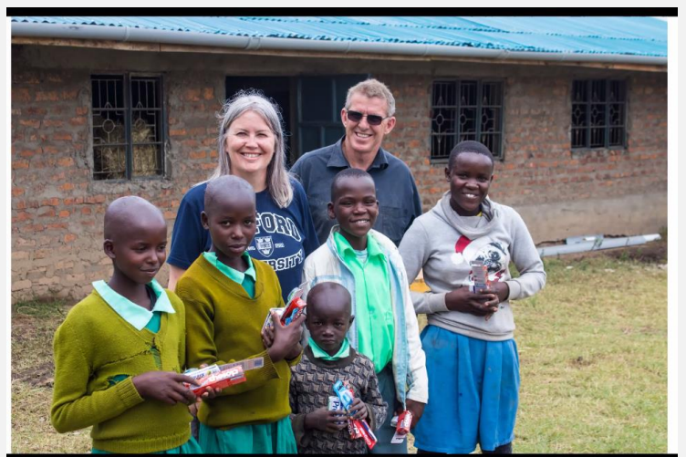
Provision of dental care products