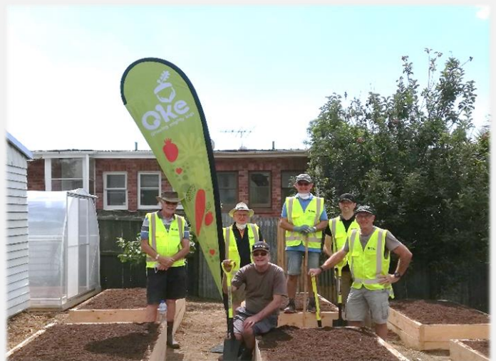
6 of 8 Rotary team