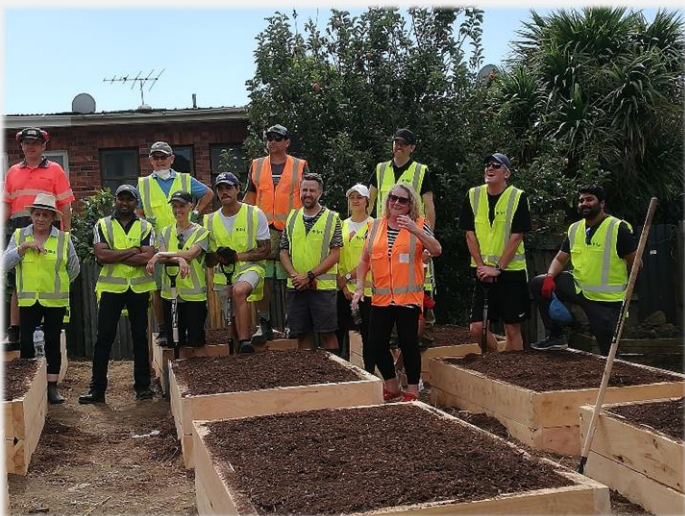
OKE and Fletcher Living Team