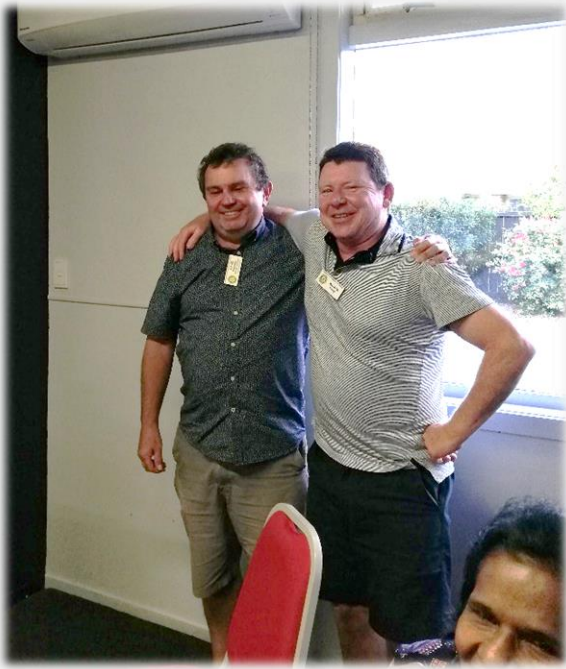
Brothers in arms? (Same Hairdresser?)