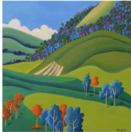
'Green on Green' 30.5cm x 30.5cm Acrylic on stretched canvas