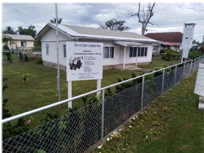
TONGA'S FIRST CATALOGUED LIBRARY