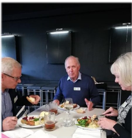
Vanuatu Traveller returns