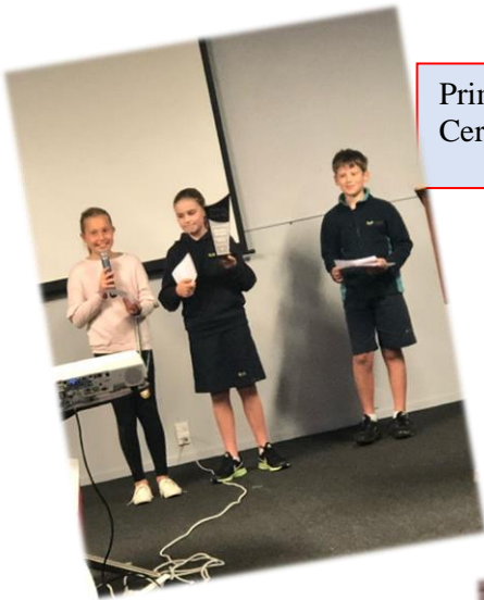
Primary student Quiz winners Certificate and Trophy presentation